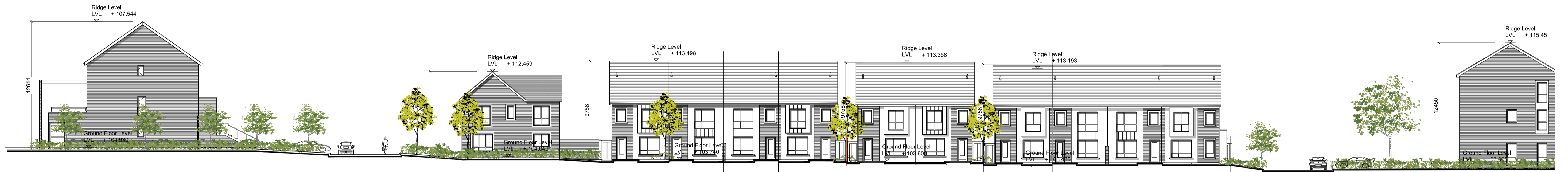
CONTEXT SECTION 4 - 4, PART 'A' Scale 1:200@A1