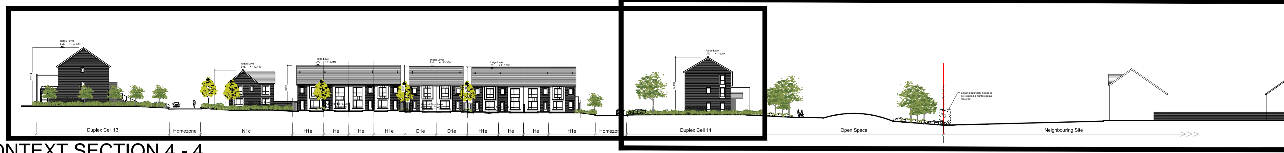
CONTEXT SECTION 4 - 4, Scale 1:500@A1